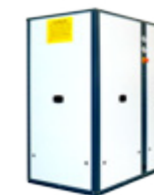
VSE Condenserless unit