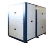
VSH Water cooled condensing unit