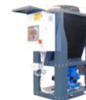
VSA Condensing unit