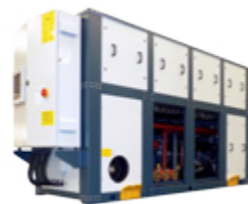
VHH Water cooled chiller