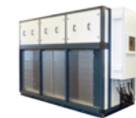
VHR Air cooled chiller plug fan